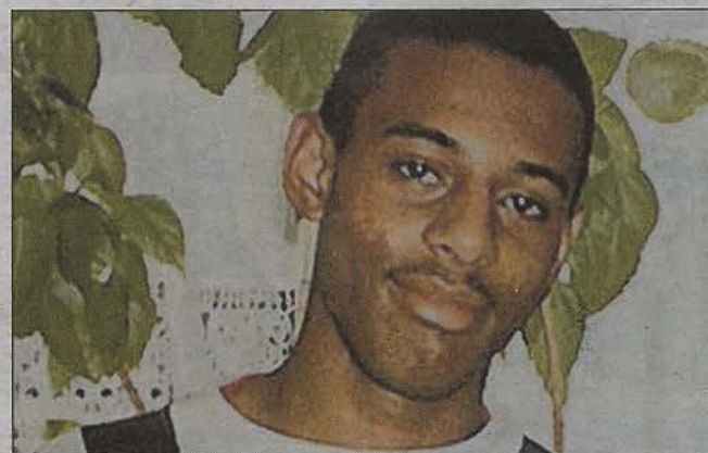
TRAGEDY: Stephen Lawrence, who was killed in a racist attack